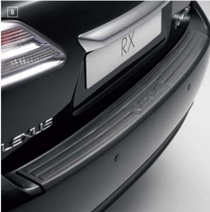
B. REAR BUMPER PROTECTION PLATE

Dependable protection against minor paintwork scuffs and scratches. The transparent yet tough self-adhesive film is custom shaped to fit the contours of the RX's rear bumper.