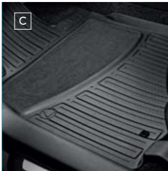
C. RUBBER FLOOR MATS For the ultimate protection against the very worst conditions. The set includes two front and two rear mats, with each tailored for a perfect non-slip fit.