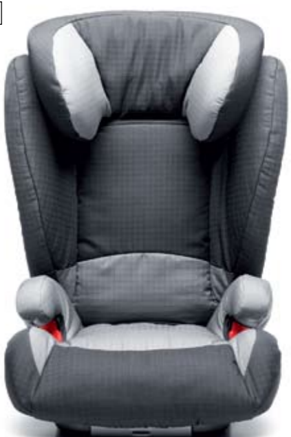
LEXUS ISO FIX For maximum safety, all Lexus ISO fix child restraint seats have a simple push-click operation to lock into the RX's rear ISO fix bars and so anchor directly to the car body. The Duo Plus also has an integral top tether to increase stability.