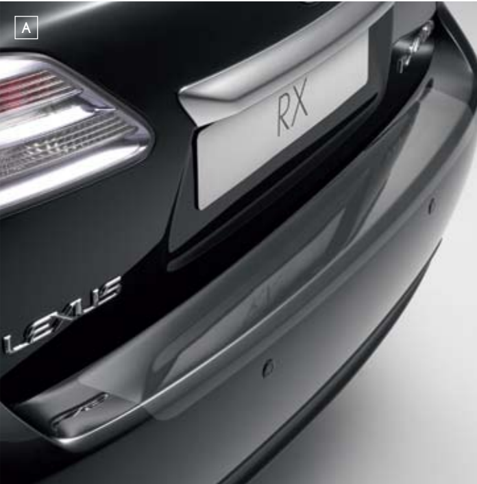
A. REAR BUMPER PROTECTION FILM

Dependable protection against minor paintwork scuffs and scratches. The transparent yet tough self-adhesive film is custom shaped to fit the contours of the RX's rear bumper.