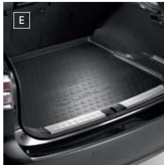
E. TRUNK LINER

Designed for extreme protection, particularly against mud and spilled liquids. The cargo liner is made of ultra-tough 4 mm rubber and has deep raised edges and a non-slip surface.