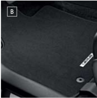
B. FLOOR MATS - TEXTILE Easy to clean, practical and stylish. Lexus textile floor mats are available in either velour or needle felt and in a range of colours. A special floor fixation holds them firmly in place.