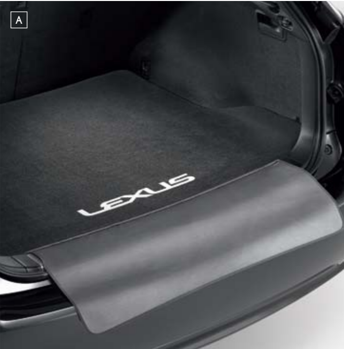
A. TRUNK MAT Hard wearing textile mat offering dependable protection for carpets against the rigours of daily use.