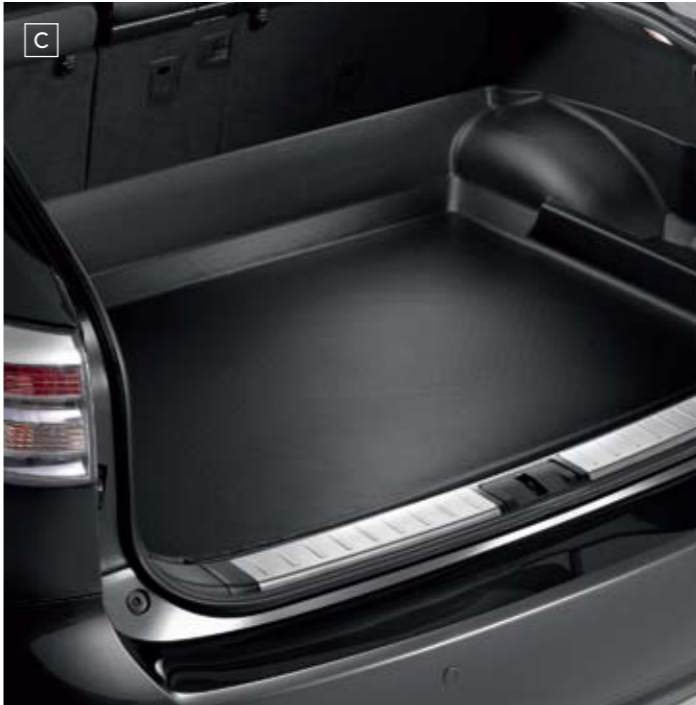
C. DOG GUARD

The ultimate high strength guard for rear bumper paintwork when sliding heavier loads in or out of the RX's trunk.