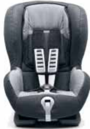
B. DUAL PLUS ISOFIX RESTRAINT SEAT

For children of between 9 months and 4 years (approximately 9 to 18 kg). For maximum safety the seat locks into the rear ISOFIX bars to anchor directly to the car body and also has a top tether to prevent forward tipping. Deep padded wings increase side impact protection.