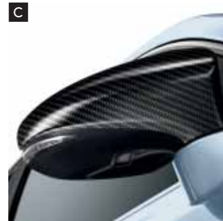
C. MIRROR COVERS

Made with a high quality chrome finish, Lexus side sills integrate seamlessly along the lower edges of the doors and so add a compelling visual highlight to the CT 200h's sculpted contours.