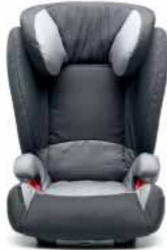
C. KID RESTRAINT SEAT

Height adjustable for children between 4 and 12 years (approximately 15 to 36 kg). A booster seat and adjustable head rest add flexibility for a growing child.