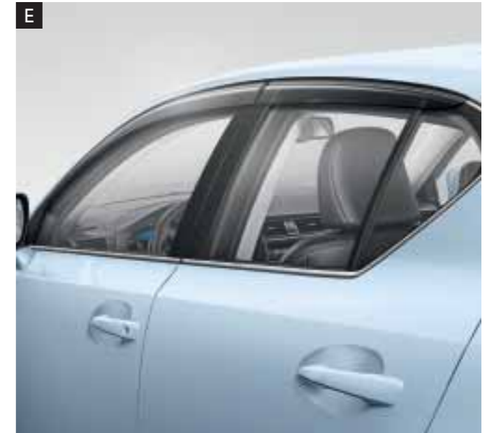
E. WIND DEFLECTORS

Custom shaped transparent self-adhesive film to guard the rear bumper paintwork against accidental scratching when loading or unloading the trunk.