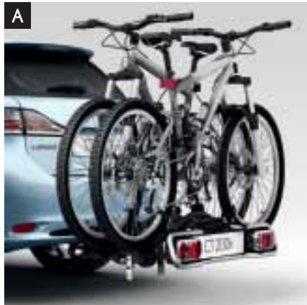
A. EASY CLICK BIKEHOLDER

Lightweight lockable steel design for carrying two bicycles. Its 'Easy Click' system simplifies installation and removal, allows tilting for trunk access and enables fold-flat storage. Complete with a lights and licence plate holder.