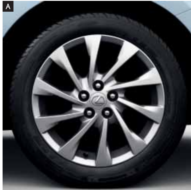
A. 16" FUJŪ ALLOY WHEELS

Powerful sporty design adding a new dimension to the CT 200h's on-road presence. Lexus alloy