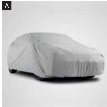
A. CAR COVER

The easy way to protect against dust and extreme weather conditions. Customised tailoring to fit the CT 200h's size and contours makes the cover very easy to fit and remove.