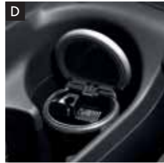
D. ASH TRAY

Clipping neatly on to pre-fitted hooks, the floor to ceiling guard helps create a comfortable travelling space for a dog while preventing it accessing the passenger area.