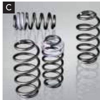
C. LOWERING SPRINGS

Replacing one nut on each wheel with a Lexus wheel lock maximises alloy wheel security. A rounded profile and coded key make the locks virtually impossible to remove with a conventional spanner.