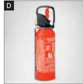
D. FIRE EXTINGUISHER

Carrying a fire extinguisher is perfectly logical. Dealing quickly and effectively with a glowing ember prevents the situation escalating.