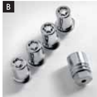
B. WHEEL LOCKS

wheels are precision engineered for low weight, high strength and long lasting good looks.