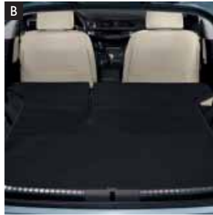
B. LONG LUGGAGE MAT

The easy way to protect against dust and extreme weather conditions. Customised tailoring to fit the CT 200h's size and contours makes the cover very easy to fit and remove.