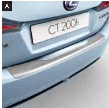
A. REAR BUMPER PROTECTION PLATE

Style and practicality combine as one. With its attractive natural aluminium finish, the rear bumper protection plate guards bumper paintwork against scratching when sliding heavier loads in or out of the trunk.