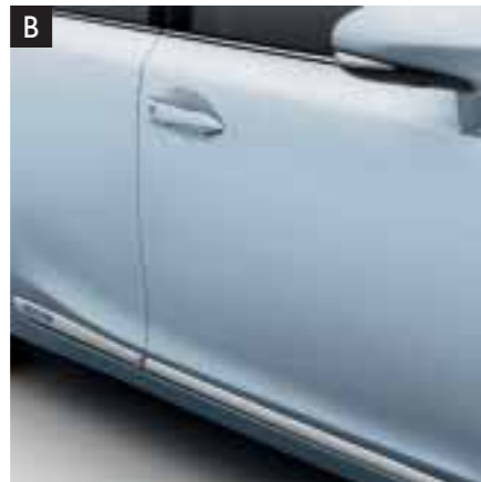
B. SIDE SILLS

Style and practicality combine as one. With its attractive natural aluminium finish, the rear bumper protection plate guards bumper paintwork against scratching when sliding heavier loads in or out of the trunk.