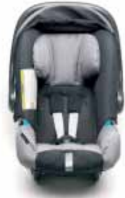
A. BABYSAFE PLUS RESTRAINT SEAT

Comfort and security for babies from birth up to around 9 months (up to 13 kg). An integral retractable canopy offers extra protection against the sun and wind.