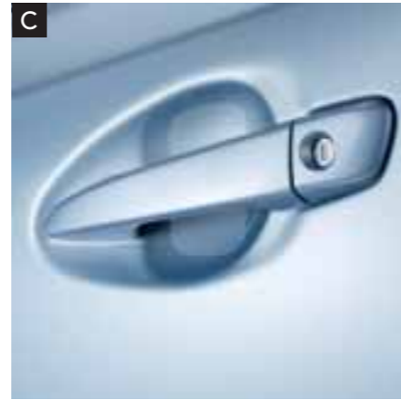
C. DOOR HANDLE PROTECTION FILM

Made of a robust PVC material to guard the upholstery and carpets against accidental damage. The mat is tailored to individually fit the seat and arm rest backs so that it remains firmly in place when they are folded flat.