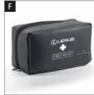
F. FIRST AID KIT

The Lexus first aid kit contains everything needed to treat those little cuts and scrapes that can so easily happen.