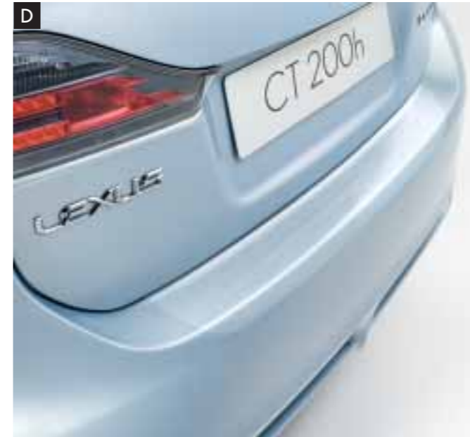
D. REAR BUMPER PROTECTION FILM

Dependable protection against minor paintwork scuffs and scratches. The transparent self-adhesive film fits unobtrusively around the CT 200h's door handles.