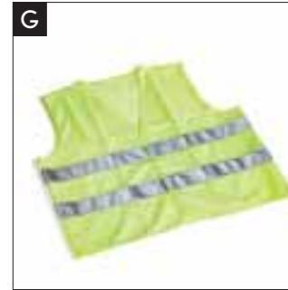
G. REFLECTIVE JACKET

See and be seen is a golden rule of personal safety. The Lexus reflective jacket is designed for high visibility.