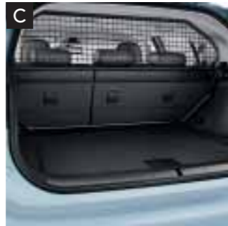
C. DOG GUARD

Luggage or bags sliding in the trunk can be a distraction to the CT 200h's ultra quiet ride. The horizontal cargo net provides a convenient time-proven solution.