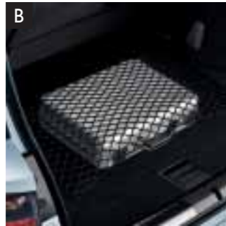
B. HORIZONTAL CARGO NET

So simple in concept and yet reassuringly practical. The vertical cargo net clips on to pre-fitted hooks in the trunk and will hold smaller items neatly in place.