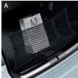
A. VERTICAL CARGO NET

So simple in concept and yet reassuringly practical. The vertical cargo net clips on to pre-fitted hooks in the trunk and will hold smaller items neatly in place.